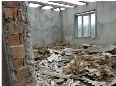
The old roof material: rotten wood, mud, straw, and asbestos roofing.

Shortly after we wrote our last prayer letter, we ended up buying the house in Soroca. Thank you very much for praying for us in this decision, as it was not without challenges that we were able to see the Lord work out. We were hoping to put off replacing the roof, but it needed replaced in order to resolve several problems, which ended up costing much more than we had expected. Lord willing, the roof will be completed and the house closed up with most of our belongings before we fly out on July 31st. We have most of the inside of the house to complete upon our return from furlough, but we are thankful for God's provisions and the work completed thus far. Please pray for the finishing of the roof to go well and that the moving of our belongings goes smoothly.